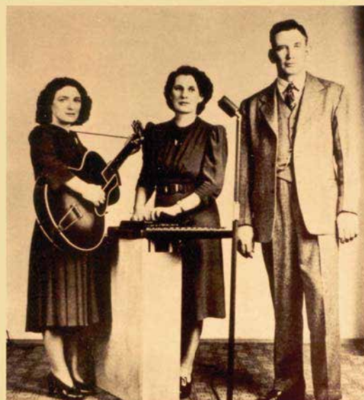
The Carter Family

The Crooked Road winds through the ruggedly beautiful Appalachian Mountains and leads you to the major hotspots of old time mountain music, country music, and bluegrass. Alive and kickin' for today's fans, these venues preserve and celebrate musical traditions passed down through generations. Annual festivals, weekly concerts, radio shows, and jam sessions ring out to large audiences and intimate gatherings. Please visit the Crooked Road website to plan your trip to coincide with the current entertainment events.