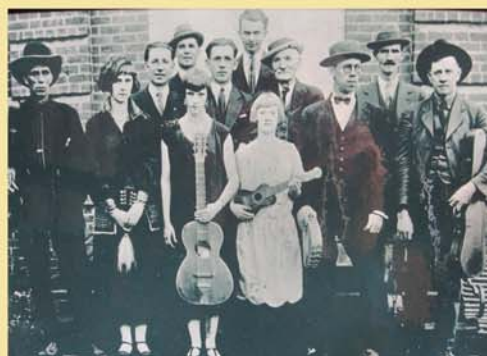
The Powers Family