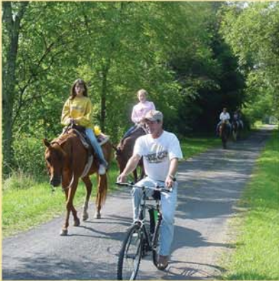
New River Trail