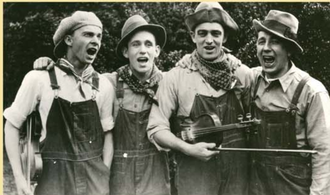
The Hill Billies

The Rex Theater and many jam sessions in Galax offer music by local artists. Only "Two songs away from Galax" is the Blue Ridge Music Center, at milepost 213 on the Blue Ridge Parkway. The Center is home to live music performances and historic exhibits. The New River Trail State Park is a 57 mile walking, bicycling, and equestrian trail that showcases a variety of scenic locations including Foster Falls and Chestnut Creek Falls. The river offers fishing, rafting, and canoeing opportunities for the outdoor enthusiast.