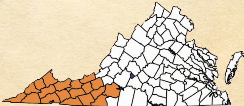
Orange indicates The Crooked Road Region of Virginia

TCR strives to celebrate, promote, and preserve the traditional music of Southwest Virginia and, in keeping with that mission, has created a comprehensive Traditional Music Education Program (TMEP). This roster, produced by the TMEP, is designed to help integrate regional music into the educational experience of Southwest Virginia's students.